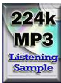
Brahms Symphony No. 1

Sound quality here is excellent, the orchestra as well-drilled as ever, and Cantelli's on top form.