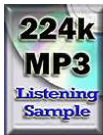
Dvorák Cello Concerto 3rd mvt. - Allegro moderato ( Ambient Stereo version )

It seems the great conductor himself had these discs made, most likely to silence his critics. Sound quality is astonishingly good for the era - this is a truly rare Beecham collector's dream!