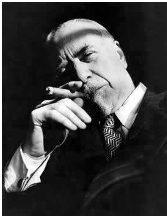
Sir Thomas Beecham